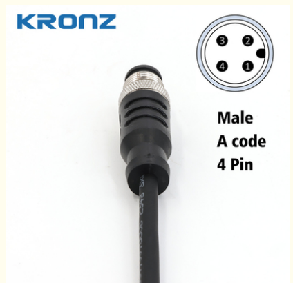
Male A code 4 Pin